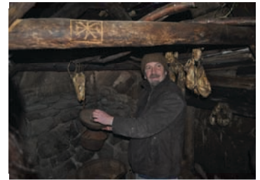
With the curator of the Sorcerer's Cottage near Hólmavík

My own fieldwork for the public folklore course has focused on masons whose skills with stone, tile, and concrete result in distinctive residences built in Reykjavik over the past century. Several come from families who have been in the trade for generations, and their experiences and traditions combine extensions of ancient rural craftsmanship with narrative patterns and customary practices common to the building trades internationally.