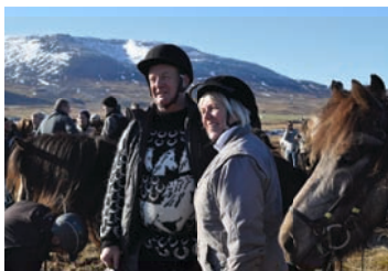
Riders at the Horse Roundup in Skagafjörður

As my plane landed in August I wondered what have I gotten myself into as a visiting Fulbright professor for the fall semester in the Department of Folkloristics and Ethnology at the University of Iceland. I would have to adjust quickly to new living/working situations, develop an entirely new course on American Folk Music for a "blended" clientele of in-class and distance students, as well as teach a project-oriented class on public folklore without an established network of partners and institutions.