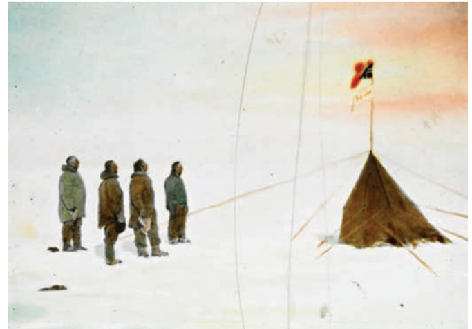
The lanternslide shows Roald Amundsen, Helmer Hanssen, Sverre Hessel, Oscar Wisting at the South Pole on December 14, 1911.