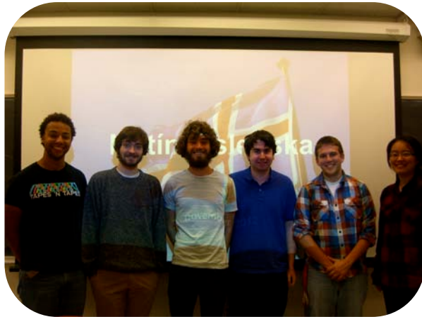
Six of the seven current students of Modern Icelandic