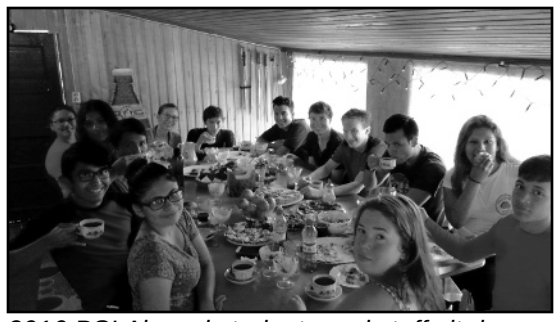
2016 PSI Abroad students and staff sit down to dinner together during a trip to the banya