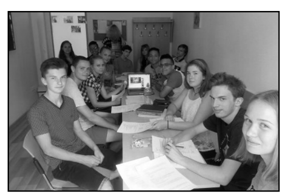
PSI Abroad students and peer tutors