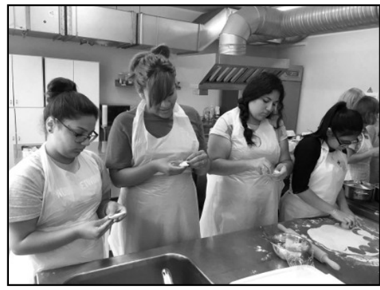
PSI Abroad students learn to make pel'meni