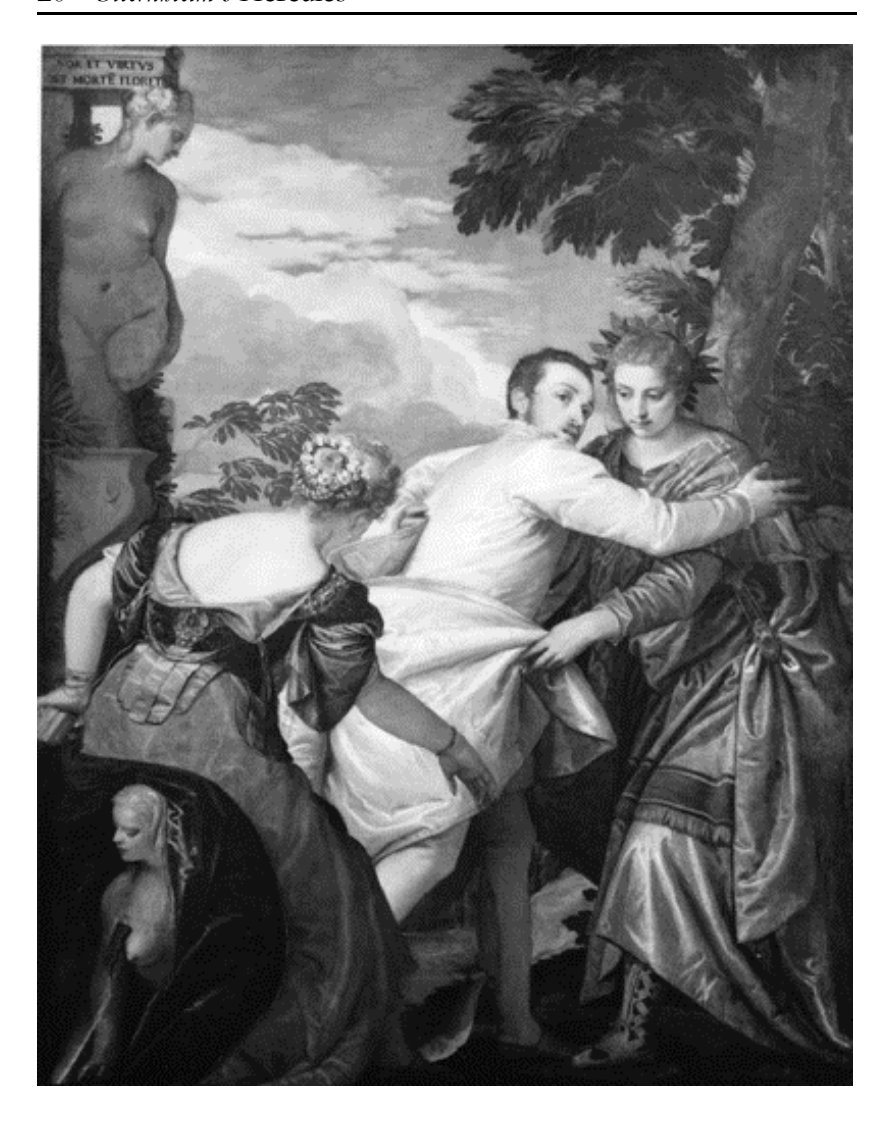
Figure 4: Veronese's Allegory of Virtue and Vice (The Choice of Hercules).