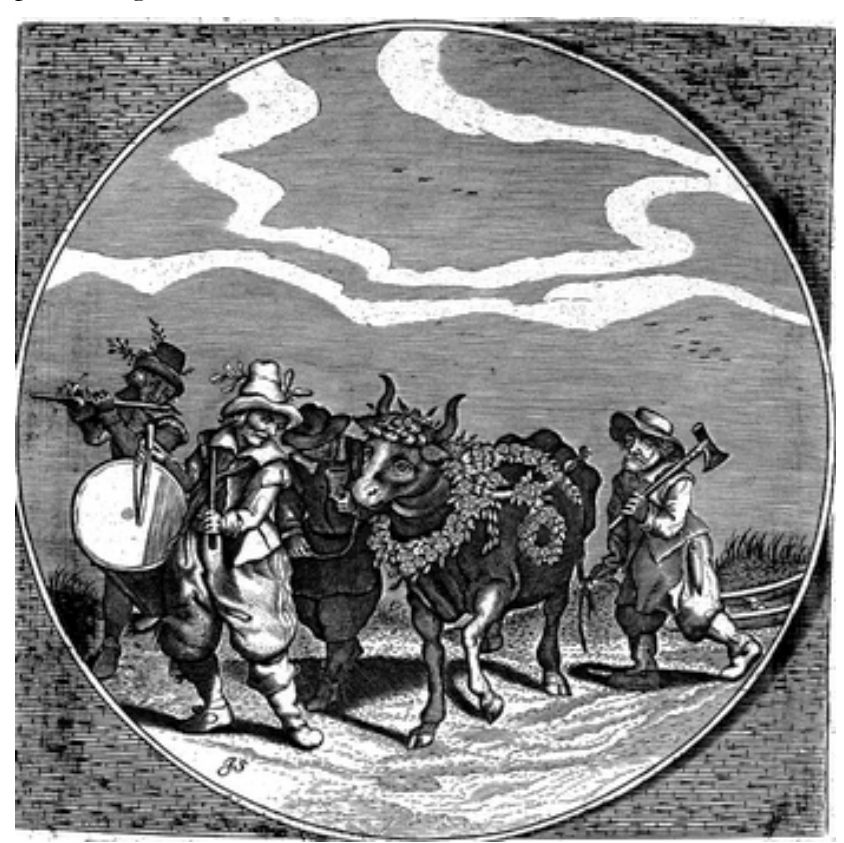
Figure 1: From Jacob Cats, Sinne- en minnebeelden (1627). Emblem project Utrecht, 2002.

as the previous emblem.<sup>15</sup> This time Fru Lusta verbally paints the picture of a spider web in which mosquitoes become ensnared, but wasps escape. Fru Lusta supplies the explanation that the spider web is like the law; the poor and unfortunate are caught, but the powerful go free.