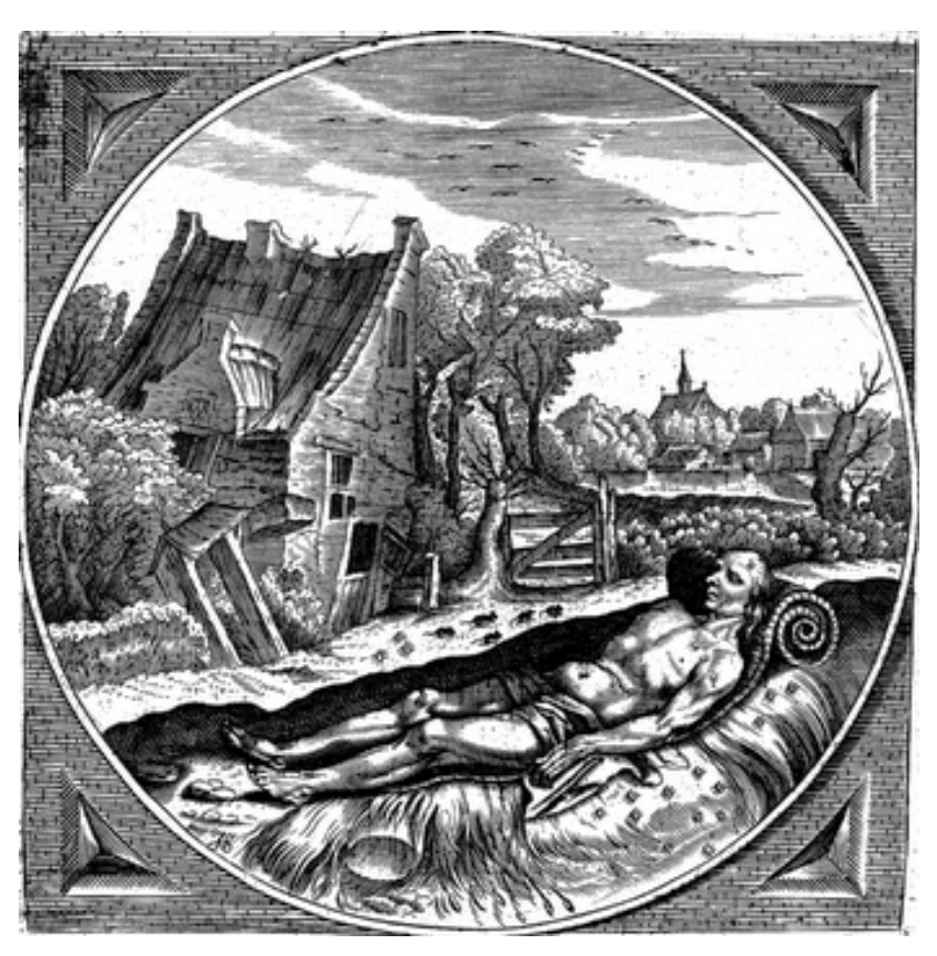
Figure 3: From Jacob Cats, Sinne- en minnebeelden (1627). Emblem project Utrecht, 2002.