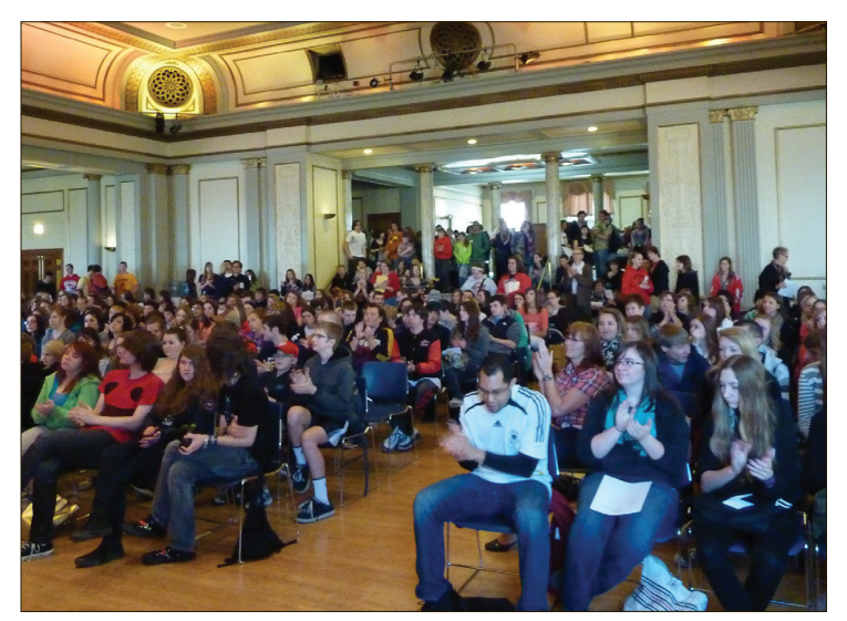
Students and teachers fill Memorial Union's Great Hall.

Once again, Memorial Union was filled this spring with over 500 students from 28 high schools and 10 middle schools to participate in our annual German Day, which was held on April 19. In addition to the tried and true contests, such as Spelling, Poetry, Skits, Music, DVDs, and Posters, this year we tested out a new contest: Pictionary. It was by all accounts a complete success and has already found its place on next year's program. There was no specific motto for German Day this year, which meant that students had complete freedom to come up with creative ways to advertise German at their schools. Our 24<sup>th</sup> German Day will take place on April 17, 2013, in Memorial Union. We look forward to meeting new teachers, reconnecting with old friends, being inspired by enthusiastic students, and helping maintain the momentum of our German Day tradition, one that would not be possible without the assistance of many students and faculty in