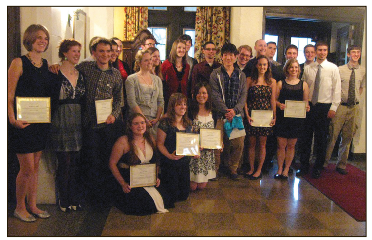
The Delta Phi Alpha inductees and undergraduate award winners (displaying their Advanced Achievement awards) can be proud of their accomplishments.