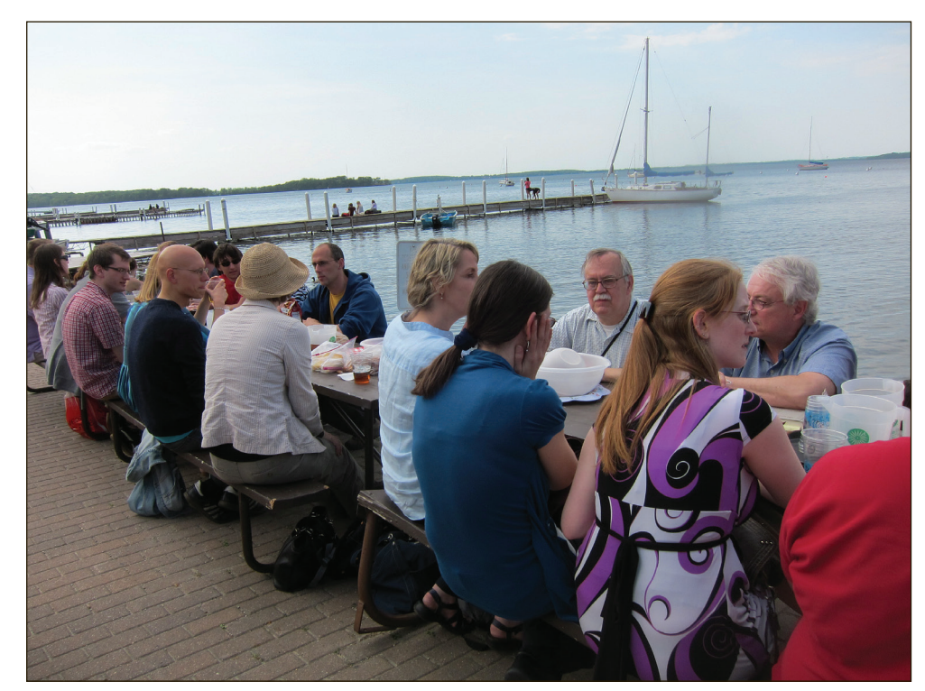
Students and faculty celebrate the end of the semester on the Memorial Union terrace.

of an education for which government and society seem to accept less and less responsibility. In our department, fellowships are not just for graduate students: in addition to numerous achievement awards (many for first- and second-year students),