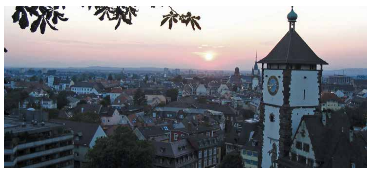
Sunset in Freiburg