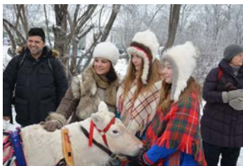
Sámi with tourists. Italian tourists posing with young Sámi at the Jokkmokk Winter Market, an event that has taken place every February for more than 400 years.