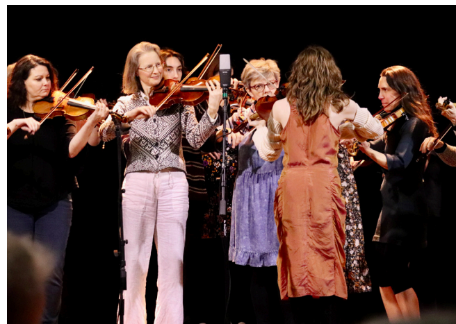
Above: The ASI Spelmanslag performs at the Cedar Cultural Center.