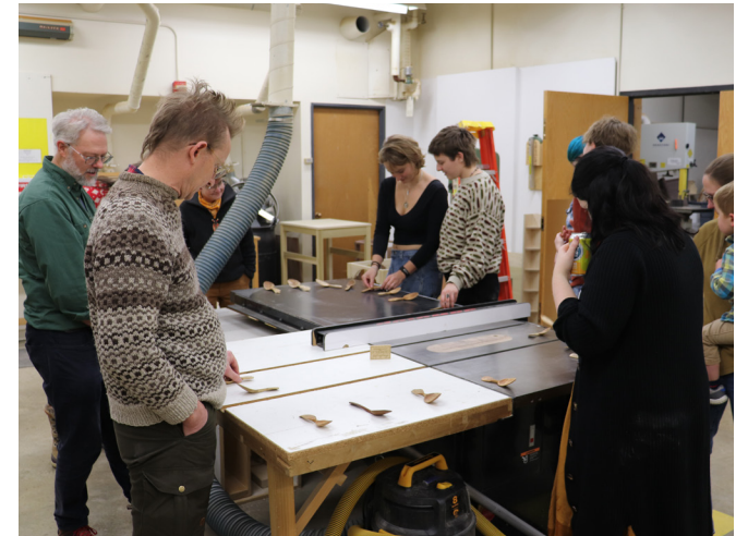
Above: Attendees choose a wooden spoon before dinner.