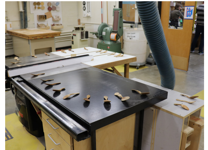
Above: Spoons waiting to be chosen for dinner.

Dinner with family and friends and dozens of wooden spoons was a perfect culmination to an already amazing few months.