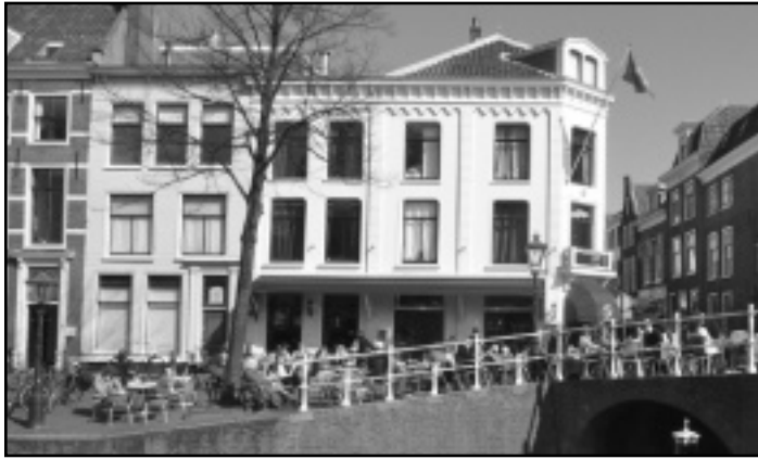
Cafe Barrera in Leiden.

we refused the medical test. When I announced this the next morning and provided the translation, it sunk in: something was indeed going on. Everyone signed.