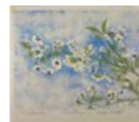
Cherry Blossom (Körsbärsblom)