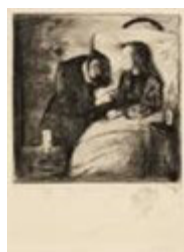
The Sick Child I (Det syke barn I)