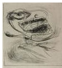
Fool in Danger (Fjols i fare)