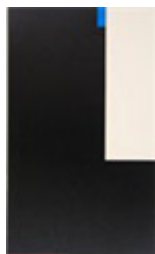
Hexagonal, from The Angles of Baertling: Open Form Infinite Space: From Cinetisme to Open Form 1949-1968