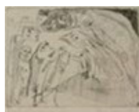
Lecture at 7 (Conférence à 7)